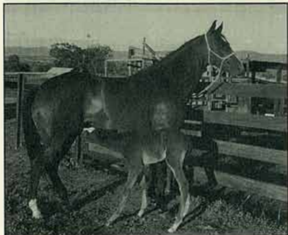
YARRANOO REGGAE with 6 day old colt foal, NONDA NATIVE LIMBO by NATIVE SON.